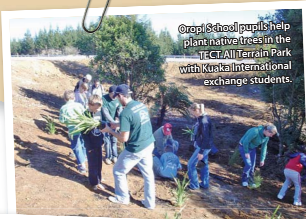
Oropi School pupils help plant native trees in the TECT All Terrain Park with Kuaka International exchange students.

KNZ operates under a globally recognised environmental management system that provides users with a practical, straightforward system to manage use of their sites in a sustainable way.