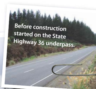
Before construction started on the State Highway 36 underpass.

Check out the story on the back for more information on Kuaka Inc. one of the many groups who have got in behind the park's development.