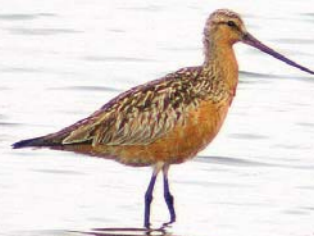
The bar-tailed godwit after which Kuaka is named.