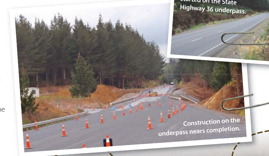
Construction on the underpass nears completion.